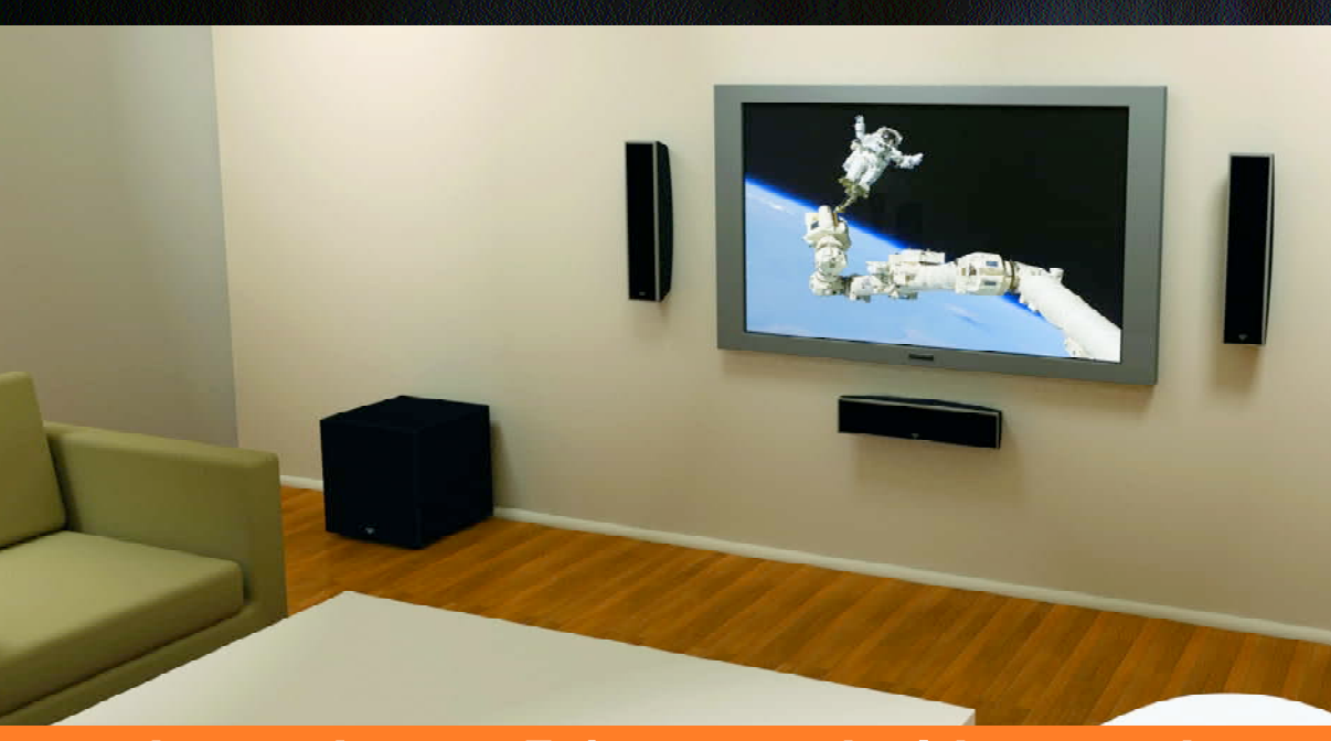
home theater 5.1 surround with a punch